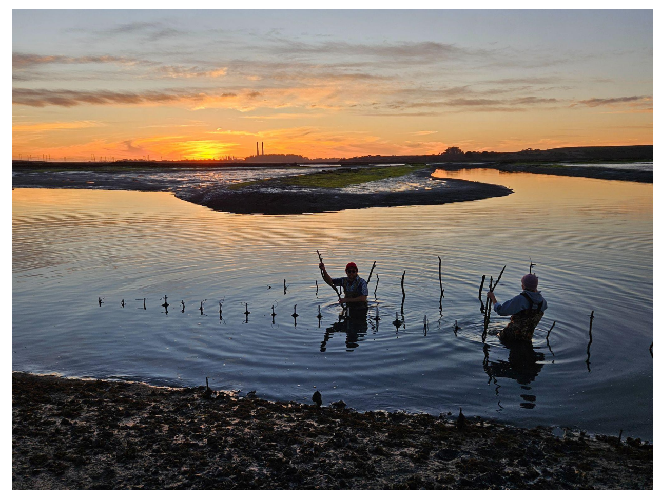
Outplanting juvenile Olympia Oysters in Elkhorn Slough for restoration