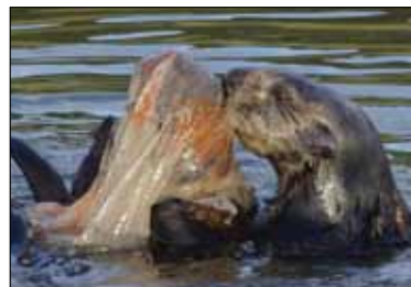
⇐ An otter pup gets stuck in a plastic bag in Moss Landing Harbor. After much work, the mother otter helped to free her pup from this relentless piece of marine debris.

Visit SaveOurShores.org to keep up-to-date on this important issue. You can also take action to end plastic pollution in your backyard by signing the petition at http://bit.ly/bag-ban .