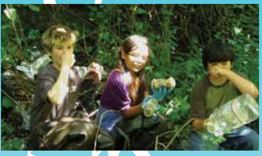
↑ Students at Soquel Elementary show their disgust at all the trash they found during their Soquel Creek cleanup!

by Ronn Rygg, Sanctuary Steward Class of 2011