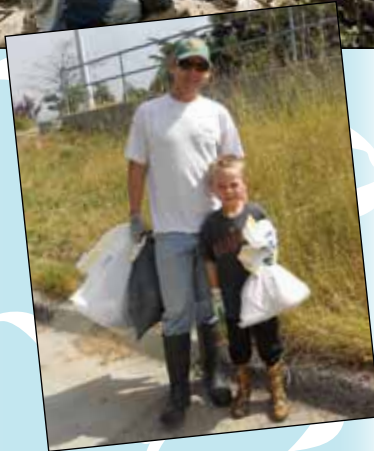
↑ Top: Combing Main Beach for trash during our 2011 Earth Day Cleanup. Bottom: Father and son team heads to the levee for the Earth Day River Cleanup. ↓ Top: Albert's Organics is working hard to protect our Sanctuary, one tire at a time. Bottom: The Albert's Organics crew cleans up their adopted section between Laurel St. and Riverside Dr. bridges.