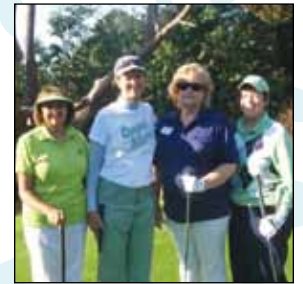
↑ The ladies from DeLaveaga's Nifty Niners Golf Club Save Our Shores through their invitational golf tourney fundraiser.

And thanks to the DeLaveaga Nifty Niners for including SOS in your Invitational Golf Tournament, and to Peter B's Brewpub for putting together a Beer Garden event in support of SOS programs.